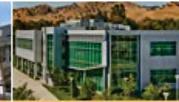
Los Medanos College