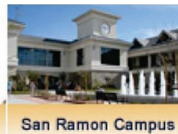
San Ramon Campus