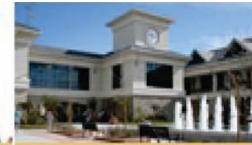
San Ramon Campus