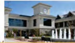
San Ramon Campus