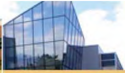
Diablo Valley College