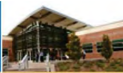
Contra Costa College