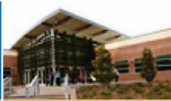
Contra Costa College