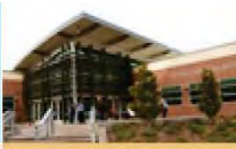
Contra Costa College