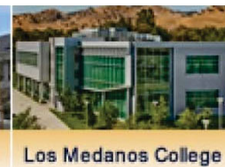
Los Medanos College