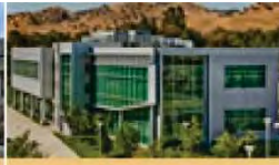
Los Medanos College