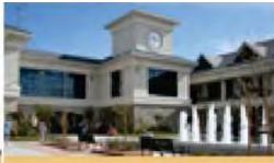
San Ramon Campus