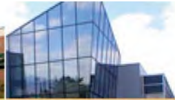
Diablo Valley College