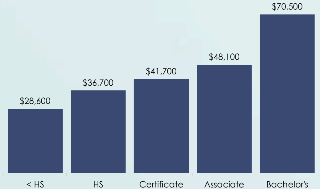
AVERAGE EARNINGS BY EDUCATION LEVEL AT CAREER MIDPOINT