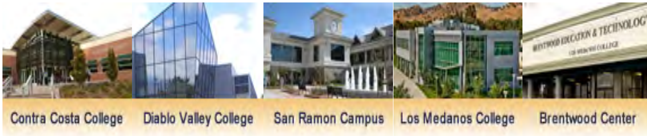
Contra Costa College