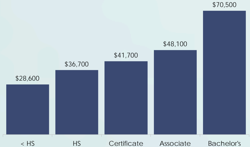
AVERAGE EARNINGS BY EDUCATION LEVEL AT CAREER MIDPOINT